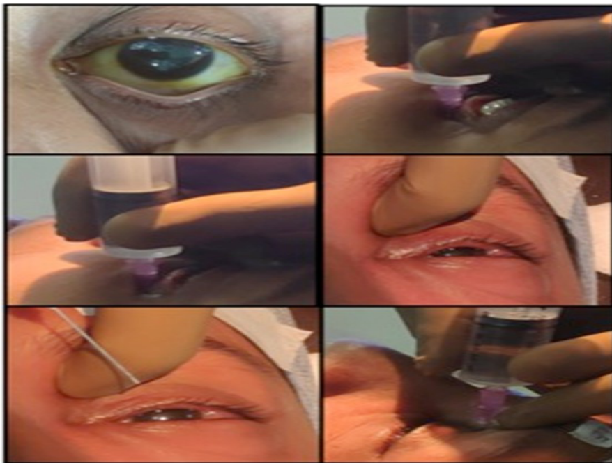
Figure 1: Technique of giving a peribulbar block

two groups. In subtenon's group 10 (20%) had no movements, 20 (40%) had flutter, 18 (36%) had partial movements, 2 (4%) had full movements. In peribulbar group 27 (54%) had no movements, 14 (28%) had flutter, 9 (18%) had partial movements, 0-none had full movements. Chi-square test showed significant difference between two groups.