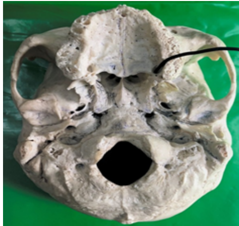
Figure 1: Probe in greater palatine foramen