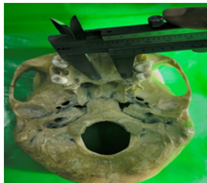
Figure 3: Illustrates the measurement of distance from greater palatine foramen (GPF) to Median palatine suture (MPS)