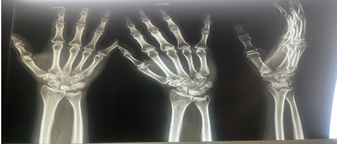
Figure 1: Preoperative radiogram of wrist showing Lunatomalacia