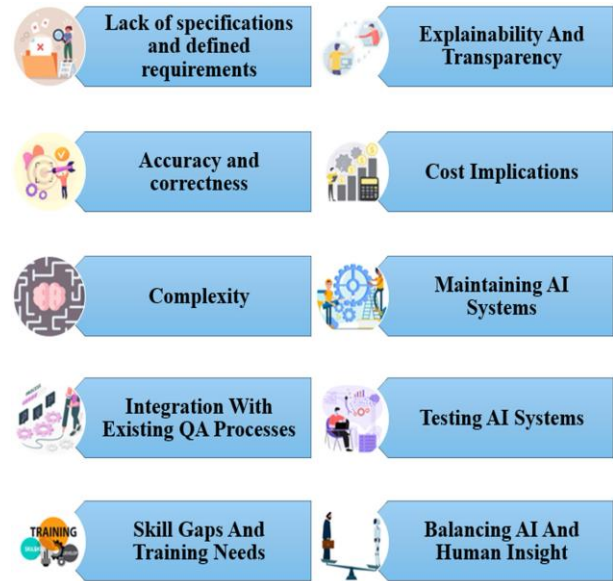
Figure 4: Challenges of AI in Quality Assurance Legend: Testing AI systems is a complex task with several unique challenges in Quality Assurance.

Balancing AI and Human Insight : Overreliance on AI: Overreliance on AI can lead to a loss of human judgment and critical thinking.