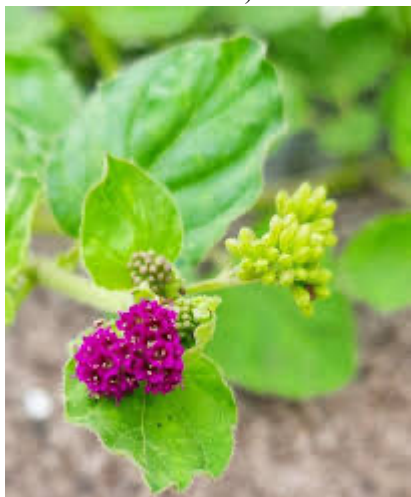
Figure 1. Boerhavia diffusa

This Boerhavia diffusa plant was collected in the Maharashtra district of Pune and then left to dry in the shade for a full day. Dried plant components, including roots and leaves, were ground in a grinder and screened through a 120 mesh (#) screen to extract powders. An expert from the Botanical Survey of India in Pune, D. L. Shirodkar, confirmed the plant's legitimacy by analysing its morphological features. The botanical sample was confirmed at Botanical Survey of India, Pune, on April 6, 2021. Its receipt specimen no. is CDP-01 (Ref. No. BSI/WRC/IDEN.CER./2021/H3).