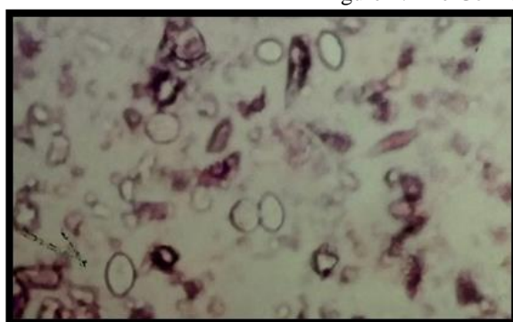
Figure 2: Cysts for G. lamblia parasite Dyed with iodine stain (10x).