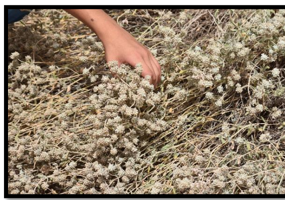
Figure 1: The Germander plant Teucrium polium .