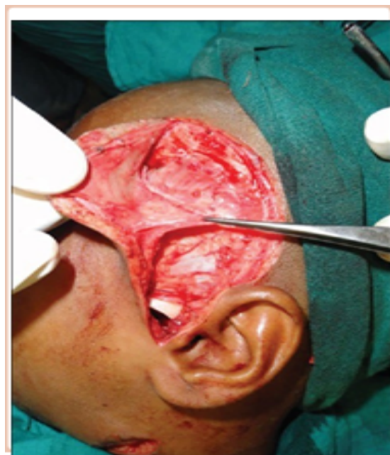
Figure 2: Clinical appearance of dissection layers

The House and Brackmann facial nerve grading system HBFNGS, [18,19,20] a clinical method of evaluating FN injury is quite