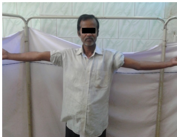
Elbow in Extension