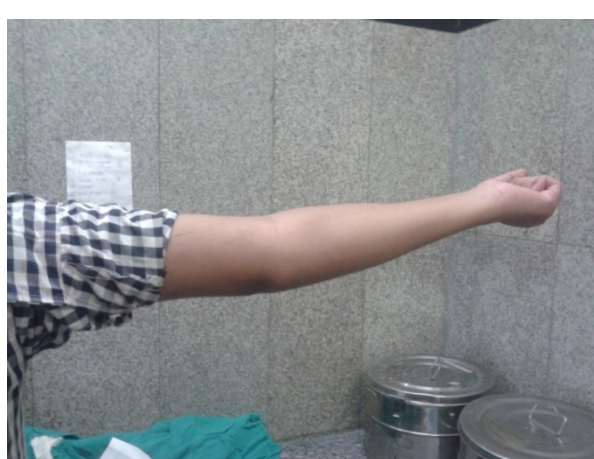
Elbow in Extension