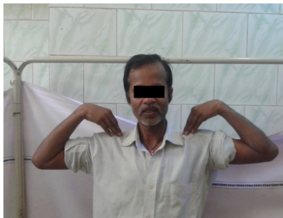
Elbow in Flexion