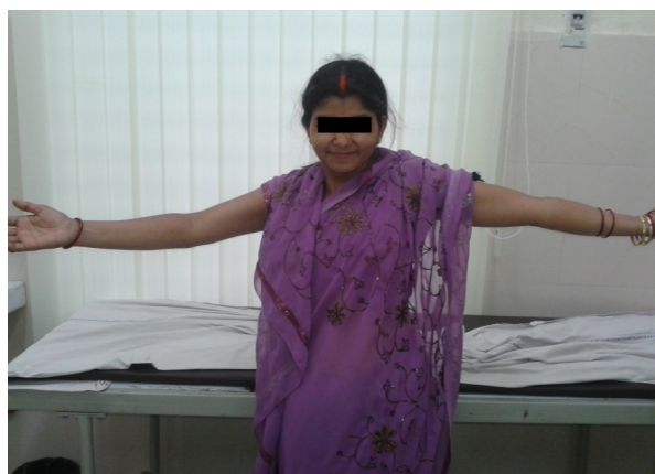
Elbow in Extension