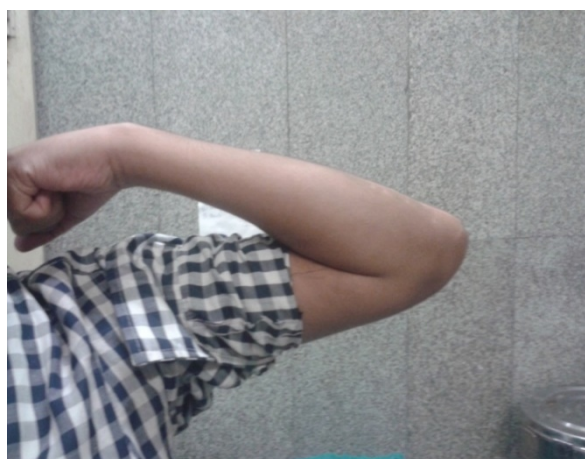
Elbow in Flexion