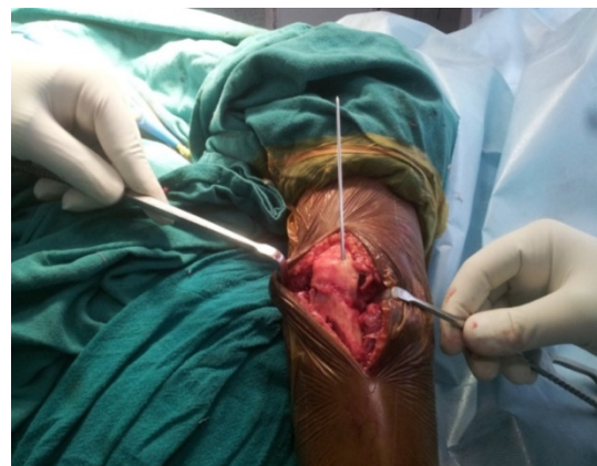
Figure 2: Position of the patient Fracture reduction and temporary fixation with k-wire