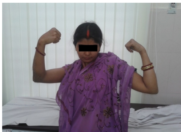
Elbow in Flexion