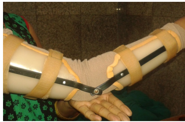
Restriction of movement