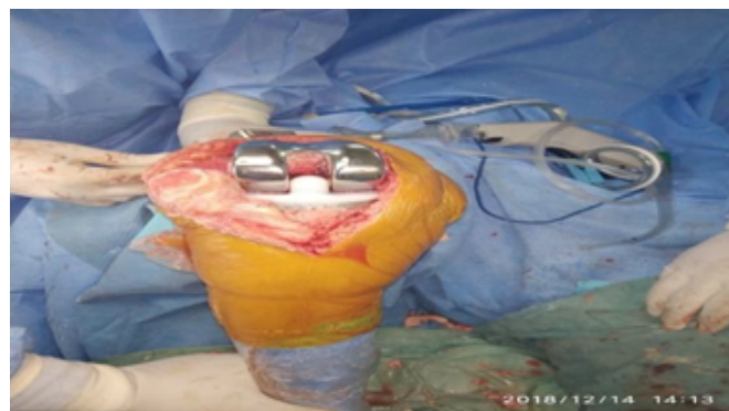
Figure 2: Cruciate Substitution Prosthesis