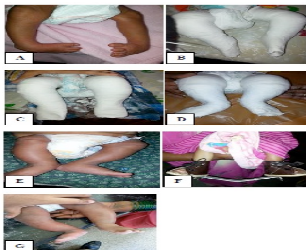
Figure 1: Clinical photographs showing 1.5 months old male baby with bilateral CTEV. (A=Showing feet at initial presentation; B=Cavus correction; C=Correction of adduction; D=Over correction of adduction; E=After correction of adduction, varus and equinus; F=Application of D-B splint and G=At final follow up the feet was fully corrected).