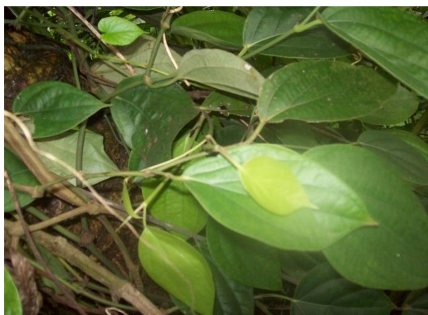
P. borbonense (Leaves and twigs)