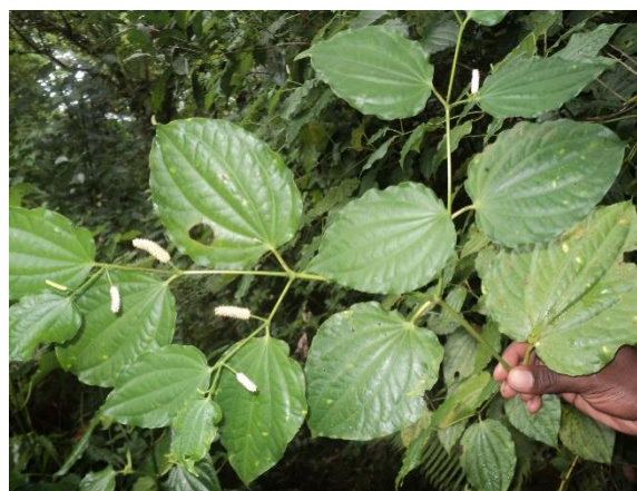
P. capense (leaves and seeds)

DC. were collected in September 2009 from the Hantsongoma forest (950 m altitude, Oichili province, NE of Ngazidja, Comoros). Seeds of Piper capense L.f. were collected in January 2010 from Nkurani ya sima forest (South of Ngazidja) and identified in Comoros National Herbarium. Voucher specimens, CIM 33 and CIM 30 respectively for Piper borbonense and Piper capense , were deposited in the herbarium of botanic department from Faculty of Sciences and Technology, University of Comoros and National Institute of Medicinal and Aromatic Plants, Morocco.