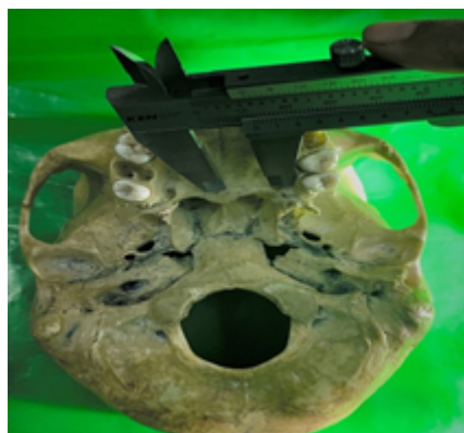
Figure 3: Illustrates the measurement of distance from greater palatine foramen (GPF) to Median palatine suture (MPS)