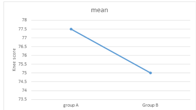
Figure 1: Show the post-operative means of the knee score of both groups.

Total knee arthroplasty (TKA) is the surgical management of choice for advanced arthritic knee joints after the failure of