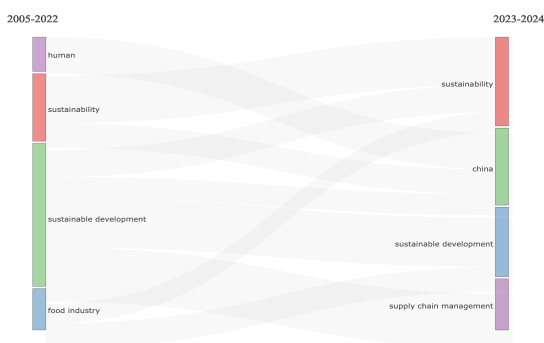
Fig. 2. (Thematic Evolution)

An examination of agroentrepreneurship, sustainable development, zero starvation, and food security underscores the significance of rural development, innovation, agroindustry, and technology adoption. Initially, innovations in technology and agroindustry were prioritised, but with the intensification of environmental and social challenges, there is a transition towards sustainability and inclusivity. This consists of nurturing inclusive rural development pathways, addressing accessibility, nutrition, and resilience, and promoting sustainable practices. Potential future advancements could involve a greater degree of technological integration, including blockchain and precision agriculture, with the aim of streamlining supply chain transparency and optimising resource allocation. Furthermore, a greater emphasis could be placed on the concepts of the circular economy, which promotes mutually beneficial connections among renewable energy, waste reduction, and agricultural production. Additionally, there may be an increased emphasis on social entrepreneurship as the evolution takes place, enabling marginalised groups and local communities to benefit from and partake in sustainable agricultural systems. It is anticipated that these themes will experience dynamic changes as a result of further research, stimulating the development of inventive approaches to attain worldwide food security and eradicate poverty in a sustainable manner.