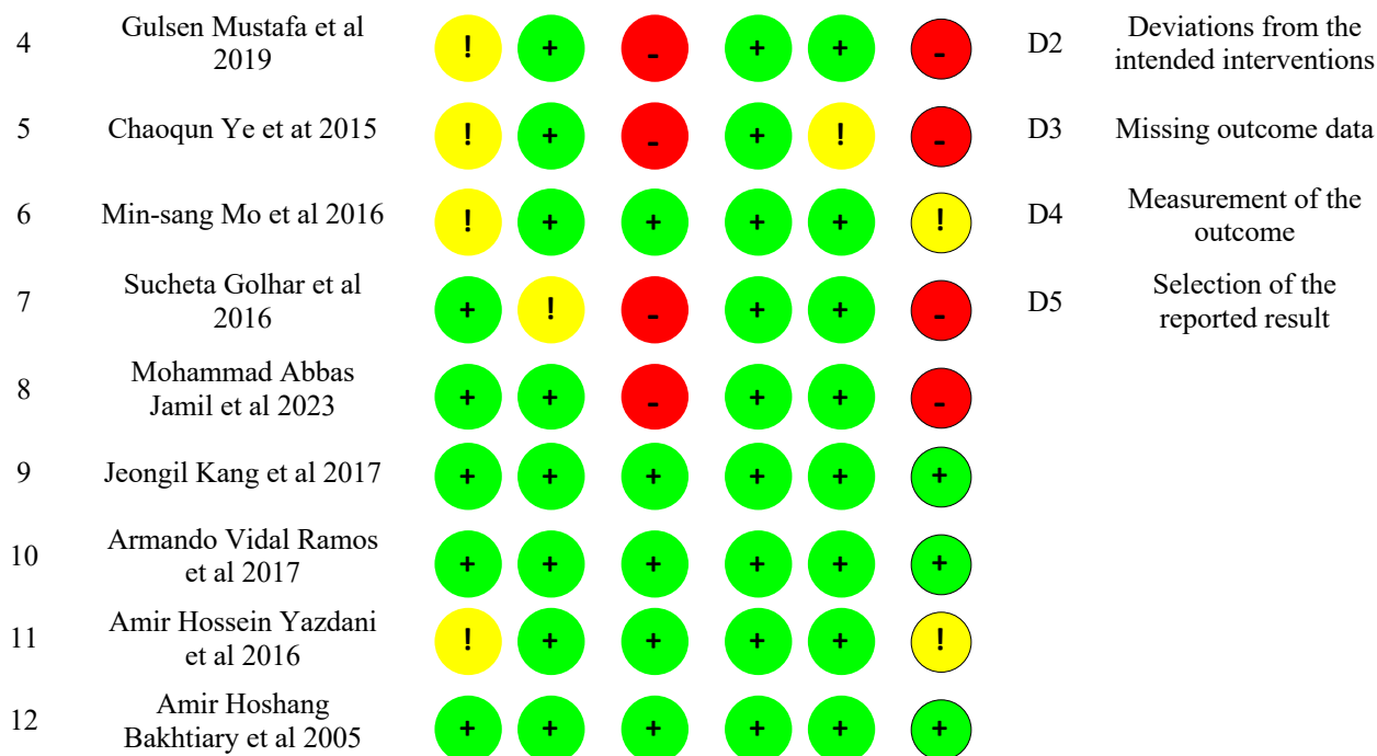
FIGURE 2 RoB Assessment Summary