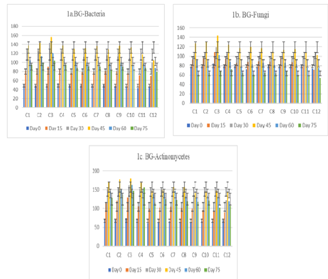
Figure 1: Microbial population dynamics during vermicomposting of bagasse and cow dung amended with biochar. (1a) Bacterial count ( \times 10^6 \text{CFU g}^{-1} ), (1b) Fungal count ( \times 10^4 \text{CFU g}^{-1} ), and (1c) Actinomycetes count ( \times 10^5 \text{CFU g}^{-1} ) across different treatment combinations

leading to changes in the functional microbial profiles of the castings and enhancing the overall vermicomposting process. However, limited research has explored the effects of biochar on organic matter degradation and microbial community composition during the gut digestion process of earthworms 36 . The variation in bacterial, fungal, and actinomycetes populations during vermicomposting is depicted below in Figure 1.