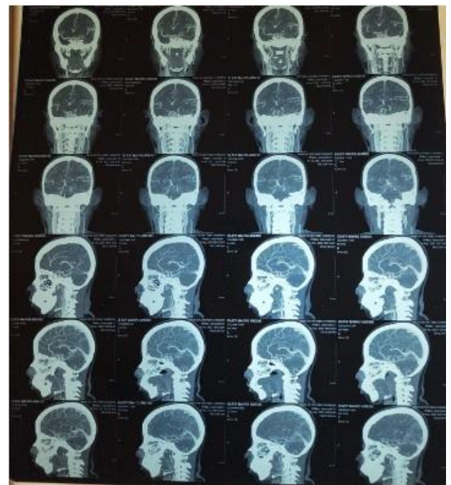
Figure 2. CT Angiography of the Head and Neck