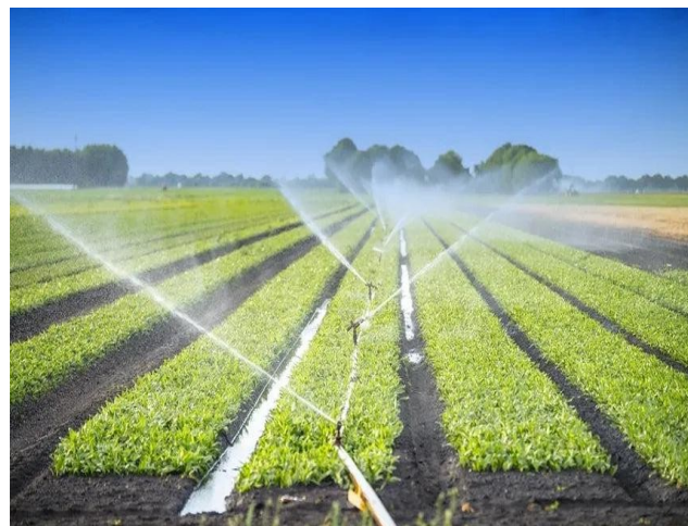
Fig 3: Fertigation System in Agricultural Field