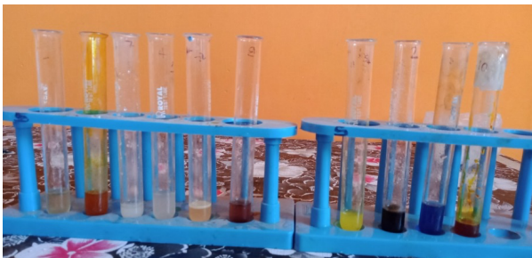
Table 2: DPPH scavenging action of Terminalia chebula Retz dried fruits

Evaluation was carried out in triplicates. Values are expressed as mean ± SD