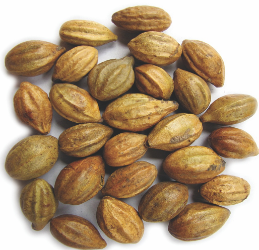
Fig. 1. Terminalia chebula Retz

Terminalia chebula Retz (Fig. 1) dried fruits were gathered in Tamil Nadu's Tiruchirappalli area. The raisins have been crushed over a smooth powder and accumulate in a dry environment and prepared for next stage.