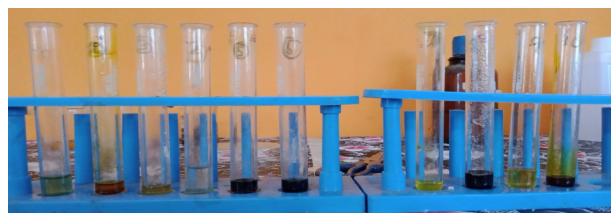
Figure 2. Phytochemical screening of ethanol extract of Terminalia chebula Retz dried fruits