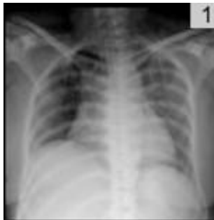
Figure 1. Chest x-ray suggested pneumonia

cephalic presentation, was admitted with a two-week history of persistent headache accompanied by fever and dyspnea. The previous pregnancy was notably in normal condition. On admission, the patient was fully conscious (Glasgow Coma Scale score 15) with stable vital signs: with respiratory rate 24–26 breaths per minute, and oxygen saturation 100% with oxygen supplementation via a simple mask (8 L/min). Pulmonary examination demonstrated vesicular breath sounds with basal rhonchi on the left side. No neurological deficits were observed. Obstetric evaluation showed fetal heart rate of 141 beats per minute. Ultrasonography confirmed an estimated fetal weight of 1420 g. Chest x-ray suggested pneumonia. During hospitalization, the patient developed fetal distress characterized by persistent fetal bradycardia (92–98 beats per minute), necessitating emergency cesarean section. A preterm neonate weighing 1300 g was delivered, with Apgar scores of 5 and 7. The amniotic fluid was clear, and a single nuchal cord was observed. The neonate required respiratory support with continuous positive airway pressure.