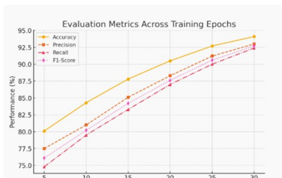
Fig. 2. Evolution Metrics across training Epochs

Figure 2 shows the association of various measures of evaluation like accuracy, precision, recall and F 1-score. The graph has four lines each of which corresponds to one of these metrics. The main goal of this graph is to show the efficiency of the yoga pose detecting system. As it can be seen, accuracy, precision, and recall metrics are stable, and the F1-score is also stable. Such consistency implies that the model works effectively in the process of identifying and rectifying yoga postures.