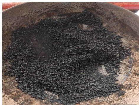
Fig. 4 chinchwa twak masi