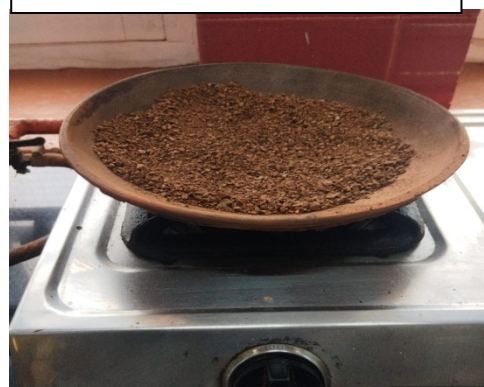
Fig. 3 krushnata and nirdhumata