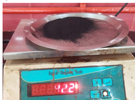
Fig. 1 dried chinchā twak

and placed over madhyamagni (mild heat 250-350 °C). Heat was given until the appearance of jet-black colour and absence of fumes 5 (Fig.3) and at the end around 42 gm of masi was obtained (Fig. 4).