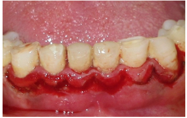
Fig. 9 EXCESS GINGIVA EXCISED IN MANDIBLE