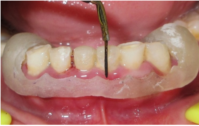
Fig. 8 SURGICAL GUIDE PLACED IN MANDIBULAR ARCH