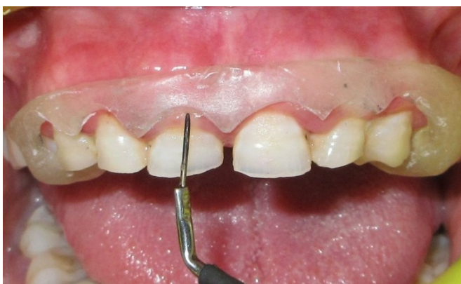
Fig. 6 SURGICAL GUIDE PLACED IN MAXILLARY ARCH