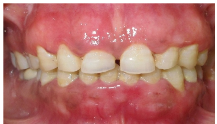
Fig. 2 PRE OPERATIVE INTRA ORAL VIEW