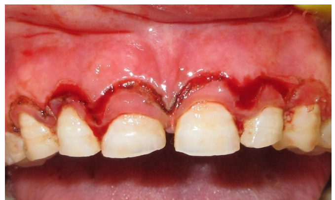
Fig. 7 EXCESS GINGIVA EXCISED IN MAXILLA