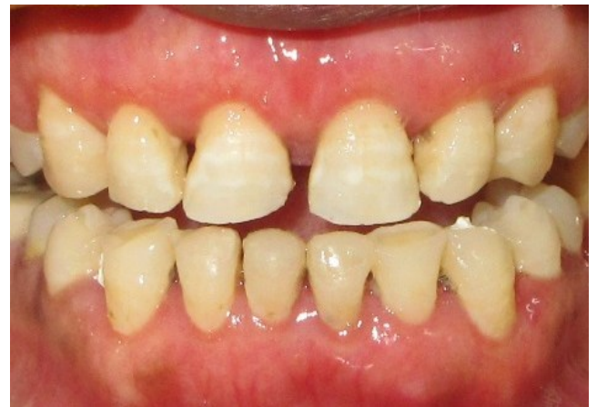
Fig. 11 3 MONTH POST OPERATIVE VIEW