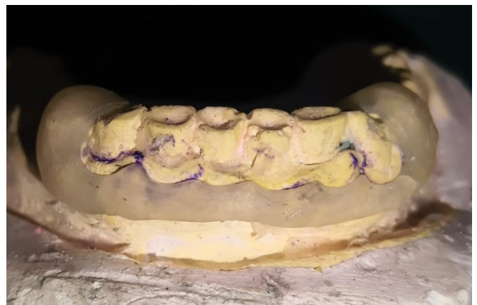
Fig. 5 ACRYLIC SURGICAL GUIDE FOR MANDIBULAR ARCH