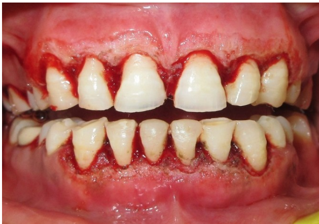
Fig. 10 IMMEDIATE POST OPERATIVE VIEW