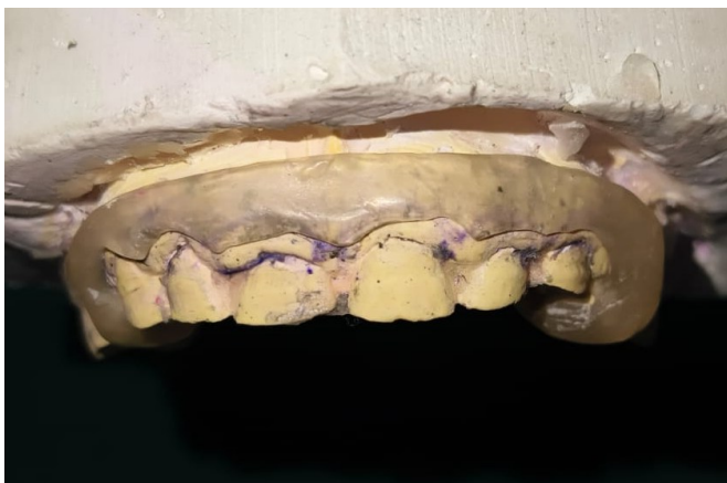
Fig. 4 ACRYLIC SURGICAL GUIDE FOR MAXILLARY ARCH