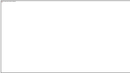
Paired t-Test Results