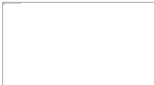
Figure 06. Mean change in AHI

(reduction), ESS (reduction), and QoL (improvement) by group. Larger bars indicate greater treatment benefit.