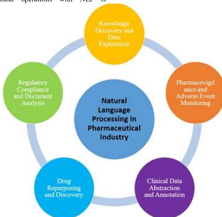
Fig.1 Natural Language Processing in Pharmaceutical Industry 4.0

pharmaceutical domain, summarized in Table I . The enhanced pharmaceutical operations with NLP is represented in Fig. 2 .