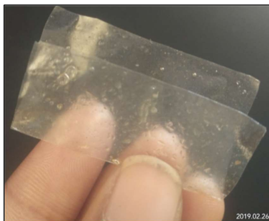
Figure 2. Folding Patch

Folding Endurance. The mean folding endurance of prepared patches was 74.6 as given in Figure 3, Table 4.