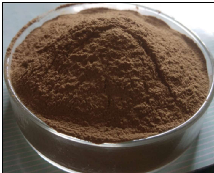
Figure 1. Dried tulsi extract