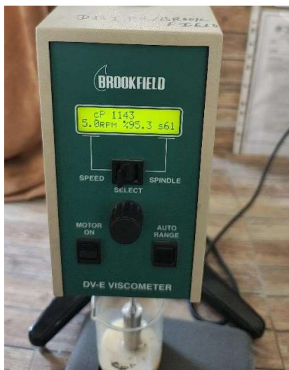
Figure 7: Viscosity of emulsion using Brookfield viscometer.

With a viscosity of 1143 centipoise (cp) demonstrated in Figure 7, the produced formulation (6) demonstrated a fairly viscous system appropriate for controlled-release applications. Centrifugation at 100 RPM for 20 minutes was used to test the formulation's stability; no phase separation was seen during this time, indicating that the formulation was physically stable under stress. The pH of the formulation was 7.0, which indicated a neutral atmosphere compatible with biological systems and usable for dermal or mucosal applications. There was no visible phase separation or precipitation upon standing, further indicating the