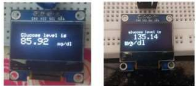
Figure 2. Readings taken before a meal and 1–2 hours after a meal.