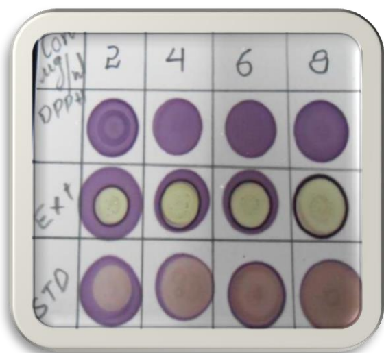
Figure.1: Dot plot assay of M. tomentosa

added and left at room temperature for 30 minutes. Absorbance of the mixture was read at 415 nm using UV–VIS spectrophotometer. Calibration curve was prepared using Quercetin as standard.